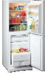
20 more fridge freezers from China