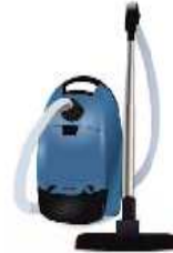
128 more vacuum cleaners from Malaysia