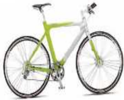
70 more bicycles from Thailand