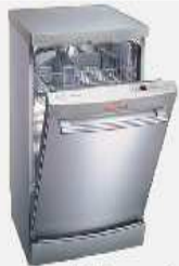
40 more dishwashers from Hong Kong